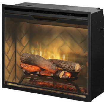
Also available in Herringbone Brick - RBF24DLX