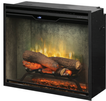
Also available in Weathered Concrete - RBF24DLXWC