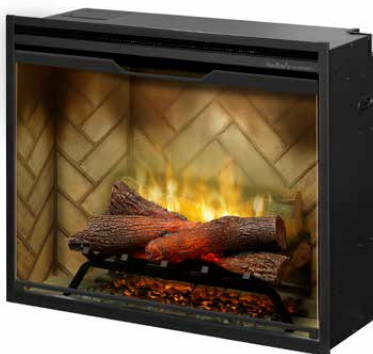
Also available in Herringbone Brick - RBF30-FG